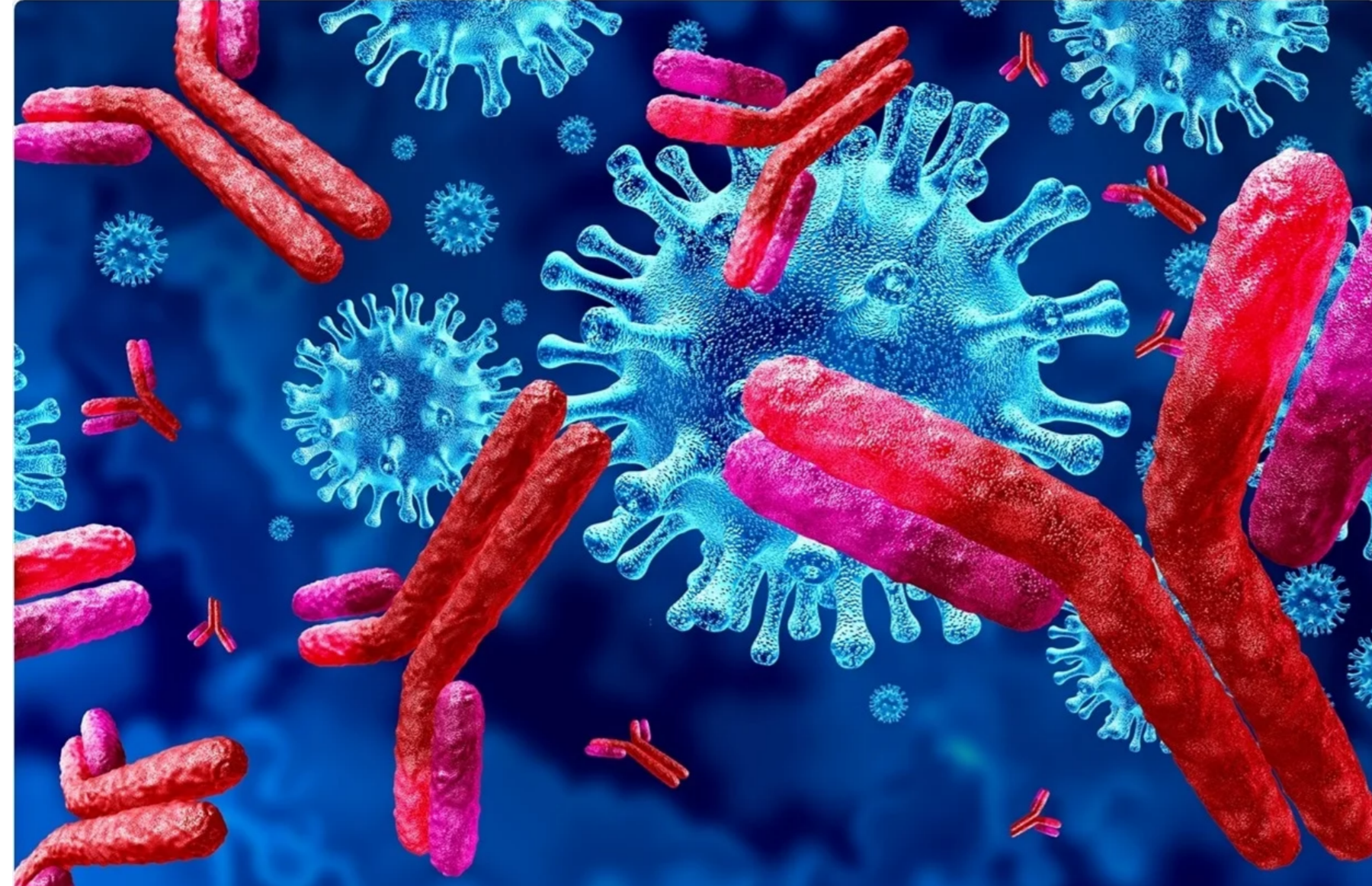
Study: Antibody Evolution after SARS-CoV-2 mRNA Vaccination .

A pre-print version of the research paper is available on the bioRxiv * server, while the article undergoes peer review.